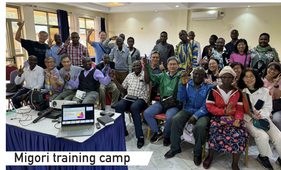
Migori training camp

In the last few weeks God revived us and many souls. From the training in Embu, the Lord's Supper in Kiugu and Mufu, the pursuit meetings in Machakos and Kianjai, the coworkers fellowship in Nkubu to the revival camp in Migori, we cannot forget the presence of the Lord and His blessings in the meetings. We experienced the closeness of God in worship and witnessed spirits uplifted and freed by the word of God. We give thanks to God for this spreading revival in Kenya. Let's hear the testimonies of brothers and sisters.